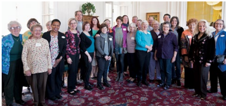
Care Committee members came from Bay area branch churches to share experiences and learn together.

I texted my friend with these ideas and reminded her that Arden Wood can be a tremendous help and immediate support. She was grateful to hear this, and I was grateful that I could use the Bible Study Library, which is open to all, to find what I needed that day—and any day! 🌿