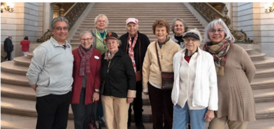
Residents at the grand staircase in San Francisco's City Hall.

Arden Wood has not only blessed Mom, but our family as well. 🌿